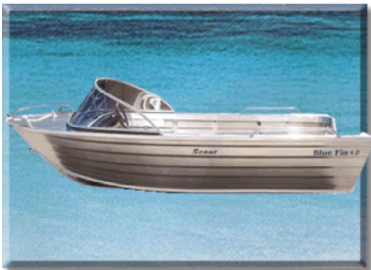
4.0 Scout Runabout - point on picture for another view

→ please visit our Gallery to view our range of available colours