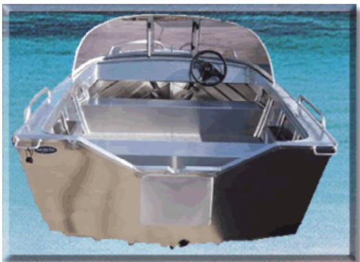
4.0 Scout Runabout - point on picture for another view