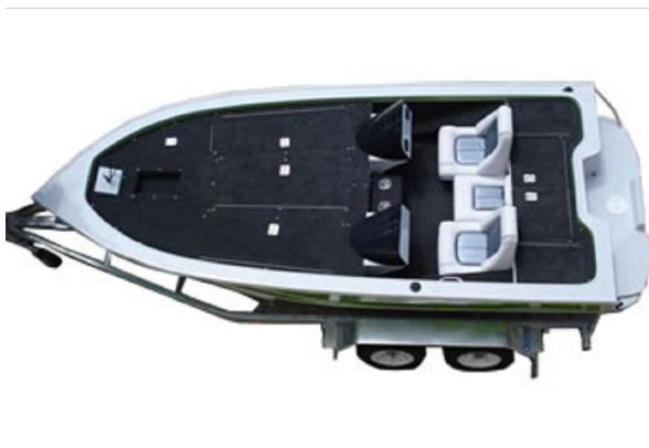
point on pictures for more images

▶ please visit our Gallery to view our range of available colours